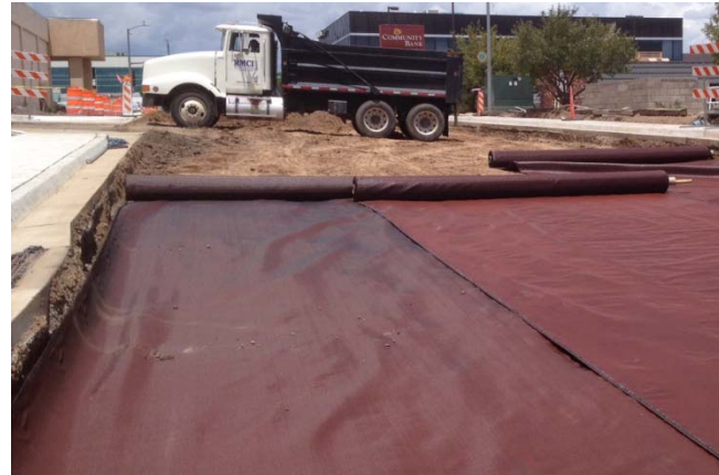
Image 7–Extending the Geosynthetic Reinforcement up a Vertical Face

When placing roadway reinforcement geosynthetics in trenches or against excavations that terminate at existing curb and gutter, the geosynthetic can be wrapped up the sides of the excavation as shown in Image 7. Doing so provides extra embedment for the geosynthetic to resist pullout and sliding forces by sandwiching the material between the vertical faces of the existing materials and the newly compacted fill.